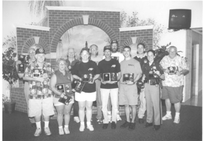
PPC League Awards

A point of interest: Out of a possible 4000 points per person, there were only 78 points separating 1 st and 3 rd places. That's close!!!